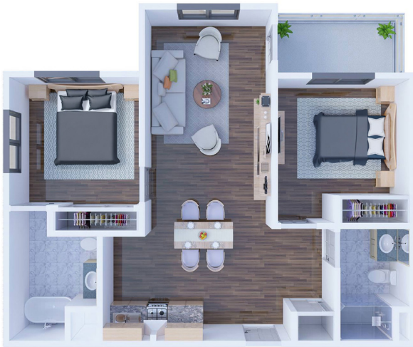
Two Bedroom 1,059 SQ FT