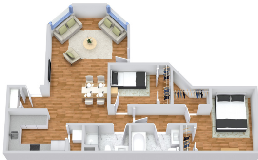
Cottage CG-2 900-1,388 SQ FT