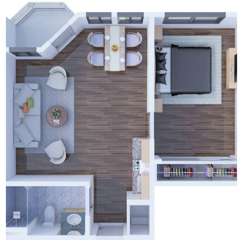
One Bedroom 599 SQ FT