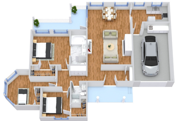
Three Bedroom 1,388 SQ FT