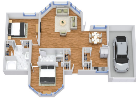
Cottage CB-2 900-1,388 SQ FT