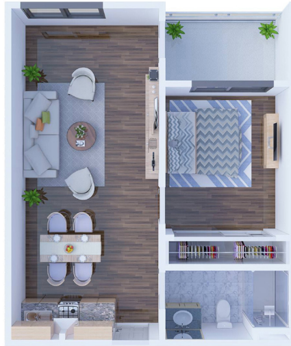
One Bedroom 599 SQ FT