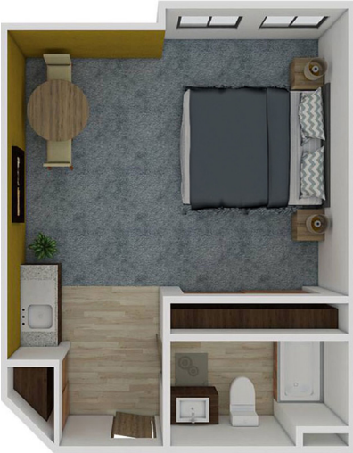
Studio 410 SQ FT

Solstice at Point Defiance offers several floor plan choices to suit your needs.