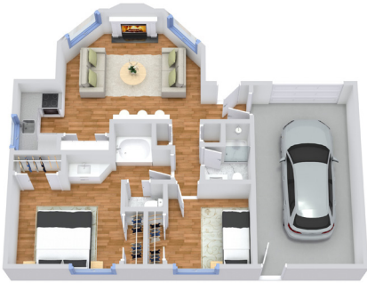
Cottage CA-2 900-1,388 SQ FT