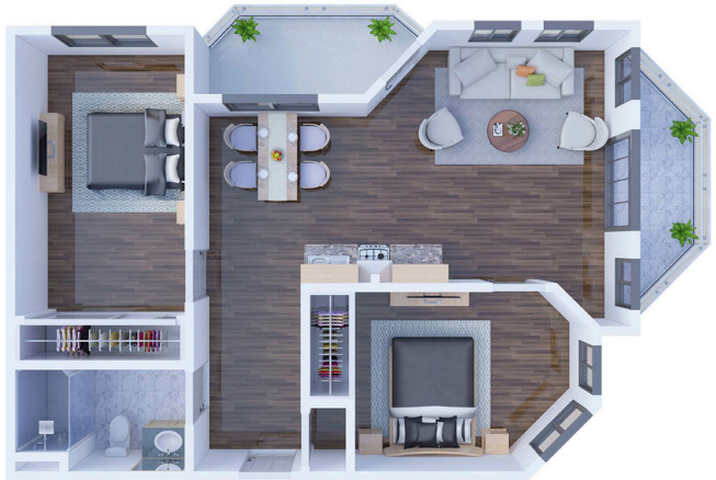
Two Bedroom 1,059 SQ FT

Solstice at Point Defiance 6414 North Park Way | Tacoma, WA 98407 844.902.1772 SolsticeAtPointDefiance.com