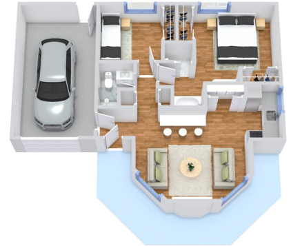
Cottage CD-2 900-1,388 SQ FT