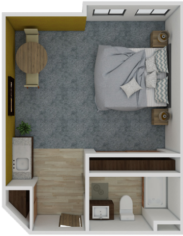
Studio 410-500 SQ FT

Solstice Senior Living at Point Defiance offers several floor plan choices to suit your needs.