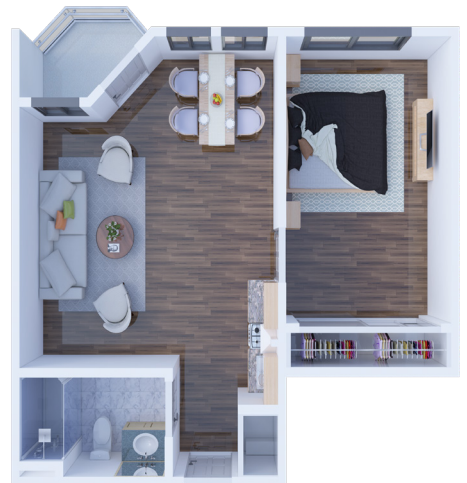
One Bedroom 589-650 SQ FT