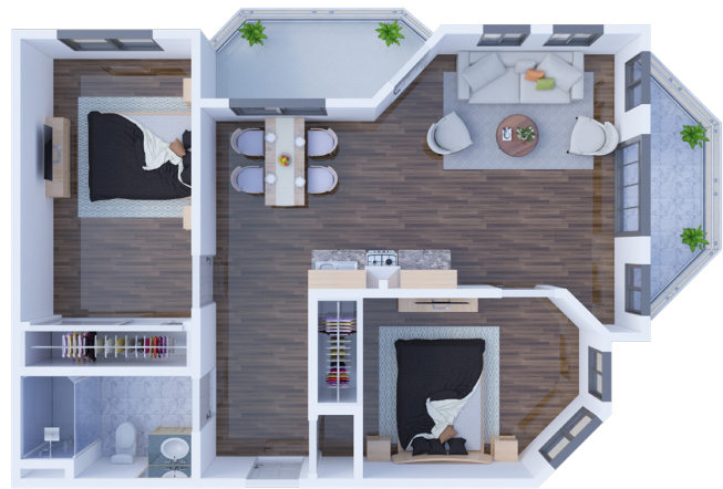
Two Bedroom 880-945 SQ FT

Solstice Senior Living at Point Defiance 6414 North Park Way, Tacoma, WA 98407 (844) 902-1772 SolsticeSeniorLivingPointDefiance.com