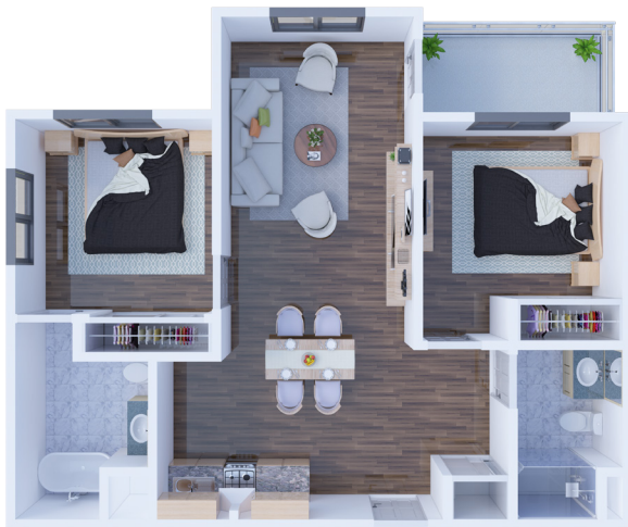
Two Bedroom 880-945 SQ FT